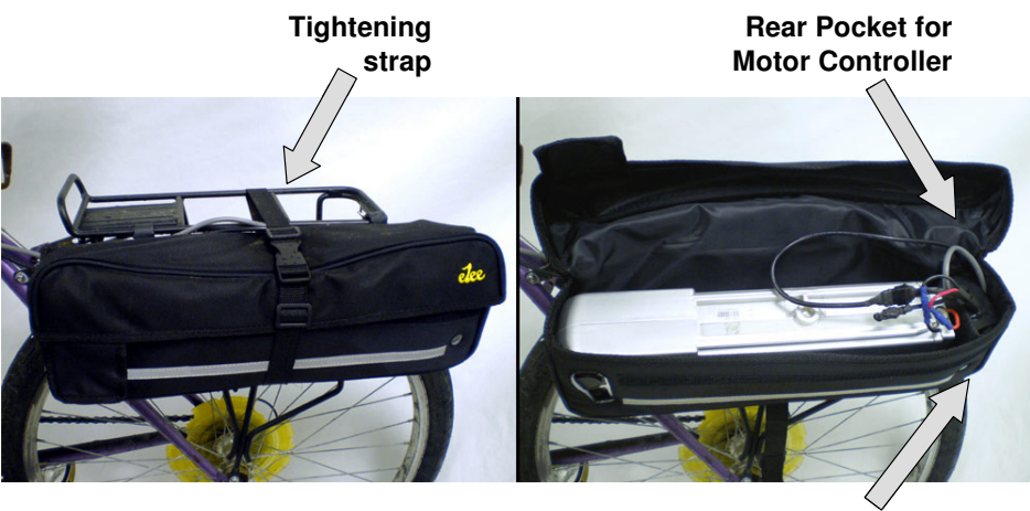
The eZee Kit Battery bag is designed to hook on a rear pannier rack. It holds both the Battery and Motor Controller.