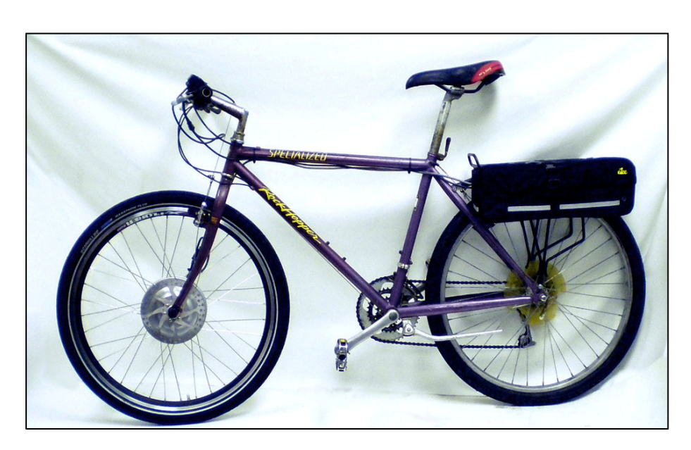
New eZee Kit installed on an old purple mountain bike

The following guide will help you successfully install your eZee Electric Bicycle Conversion Kit. This kit contains a hub motor, battery, and all the electronics necessary to bring electric power to your ride. Installation can be accomplished with basic bike maintenance tools and takes between 30 minutes and 2 hours.